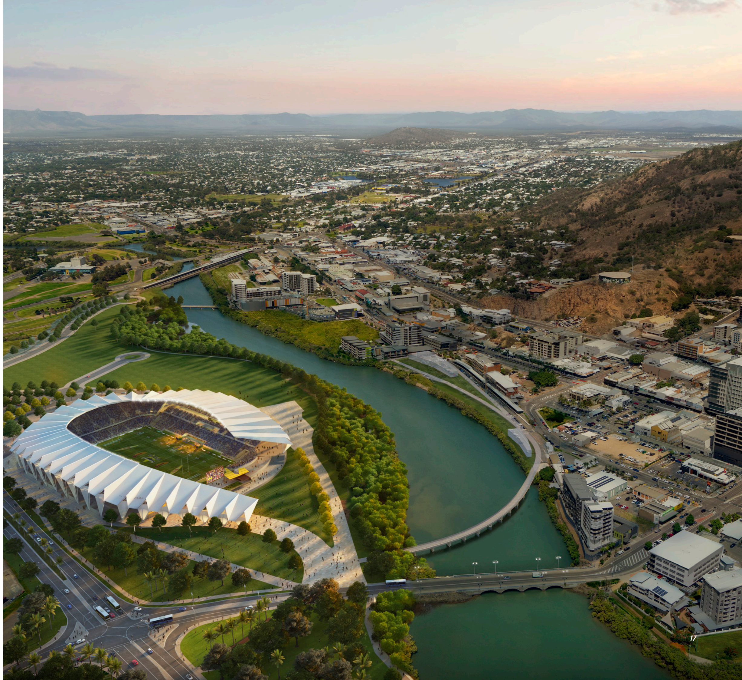
Image: Artist's impression of the North Queensland Stadium in Townsville. Part of the Townsville City Deal, it is a joint project of the Queensland Government, the Australian Government and the Townsville City Council and is supported by the National Rugby League and the North Queensland Cowboys. Construction will support 750 design and construction jobs, Indigenous employment opportunities and maximise local procurement.

For example, the Top End Association for Mental Health has received $1.9 million to construct a new mental health facility in Darwin containing rehabilitation and transitional housing elements.