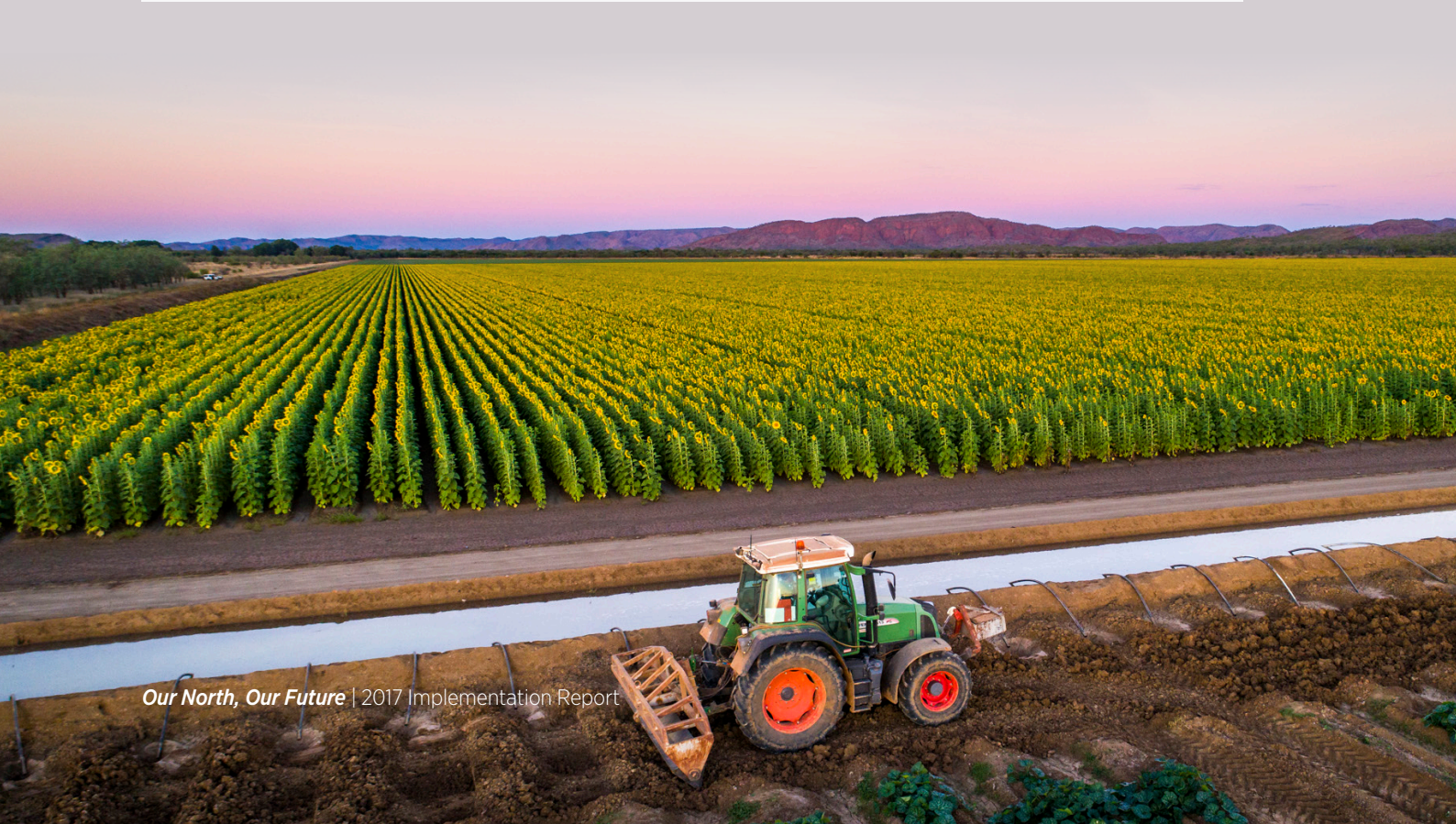
Image: Ceres Farm, East Kimberley, WA.

Read more at northernaustralia.gov.au and ceresfarm.com.au .